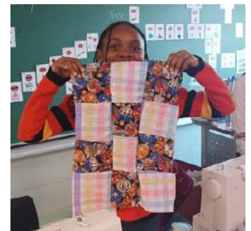
School Outreach Project at Forest Hills School, Saint John.