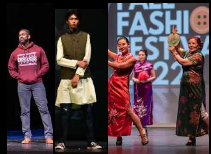
UCOF FALL FASHION FESTIVAL