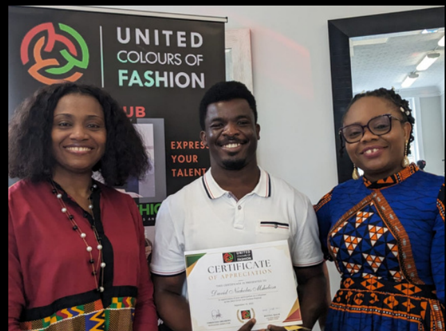
UCOF Volunteer Appreciation and Award Ceremony in Saint John