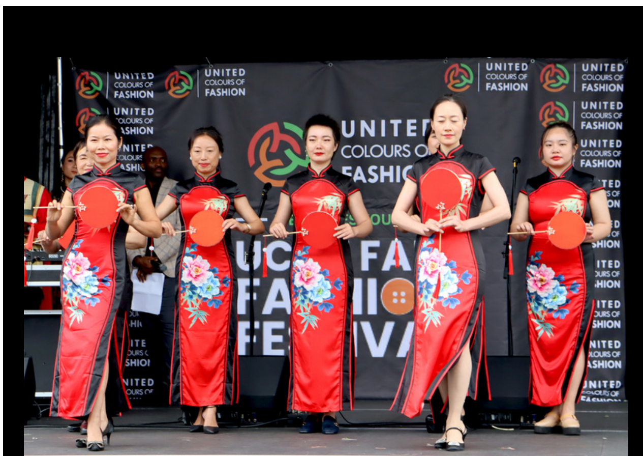
QIPAO Group, Saint John

UCOF Canada believes in the power of collaboration and recognizes that collective efforts yield greater impact. We actively seek out partnerships with other organizations that share our vision of empowerment and inclusivity. Through these collaborations, we amplify our reach, leverage resources, and pool our expertise to create meaningful opportunities for program participants. By working hand in hand with like-minded organizations, we can address the multifaceted challenges faced by newcomers and visible minority groups more effectively. These collaborative initiatives strengthen our collective impact and create a supportive ecosystem that fosters growth, success, and opportunities for all.